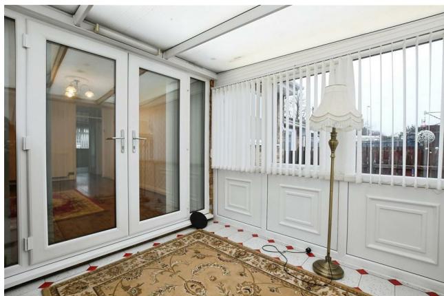
Conservatory 8'8" x 8'8" (2.65 x 2.65)

Having a tiled floor and there are French Doors giving access to the rear garden.