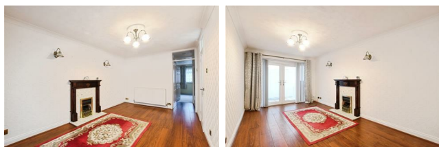
Lounge 16'9" x 10'0" (5.11 x 3.06)

Attractive laminate flooring, Adam style fire surround with marble effect back and hearth incorporating an inset coal effect gas fire, a radiator and French Doors give access to the