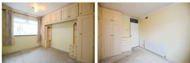
Bedroom One 11'10" x 9'3" (3.61 x 2.84)

Window to the front aspect, fitted wardrobes, bedside cabinets, a drawer unit and there is a radiator.