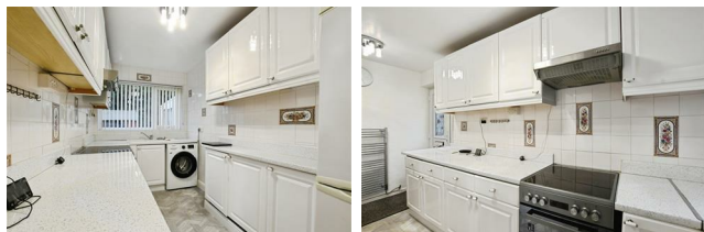
Fitted Kitchen 14'11" x 6'10" (4.56 x 2.10)

A good range of fitted floor and wall units with contrasting preparation surfaces having an inset one and a half bowl sink unit with mixer tap.. Window to the rear aspect partially tiled walls, an over head filter hood, plumbing for an automatic washing machine and there is a chrome heated towel rail.