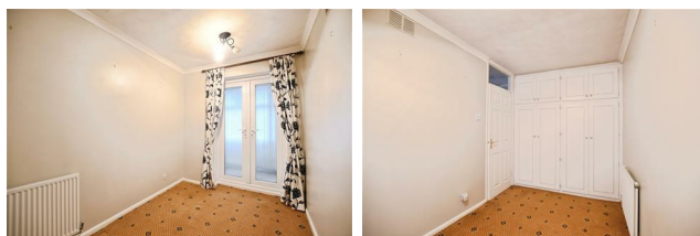
Bedroom Two 12'11" x 6'11" (3.95 x 2.12)

Window to the front aspect, fitted wardrobes, over head cupboards, a radiator and French Doors give access to;